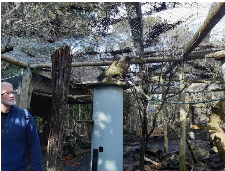
7 July Nga Manu Reccie: 'Unreciprocated interest'

See below a selection of photos from our Nga Manu trip, which 13 of us accessed by taking the train to Waikanae, walking on Waikanae country roads to and from the bird sanctuary and picnicking in the grounds after our stroll through the bush tracks at Nga Manu's bird sanctuary.