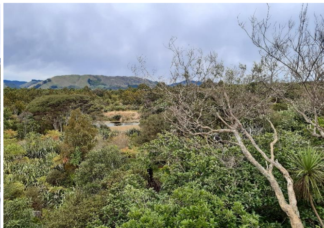
Views of Waikanae and Nga Manu grounds from the Nga Manu tower 25 th July