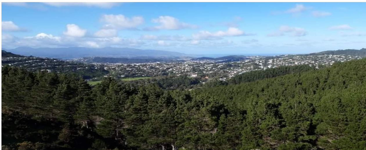
23 May 2022 - View over the Hutt taken on our Kaitoke tramp

See below a selection of photos from our Nga Manu trip, which 13 of us accessed by taking the train to Waikanae, walking on Waikanae country roads to and from the bird sanctuary and picnicking in the grounds after our stroll through the bush tracks at Nga Manu's bird sanctuary.