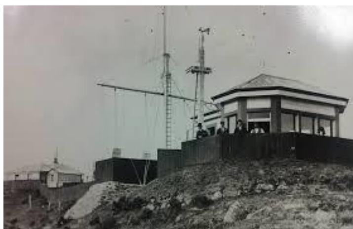
Beacon Hill Signal Station

(or in absence of internet, on 021 028 22082)