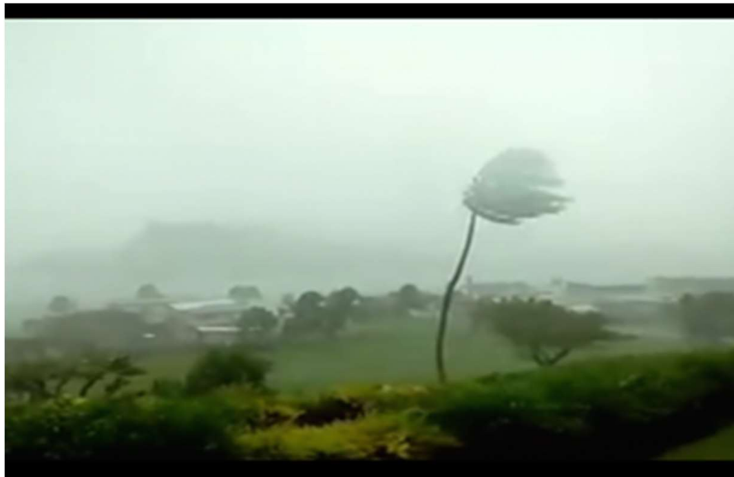
Cyclone Winston ravaging the Savusavu area in March. Saturday, April 23, 2016

“What we decide will define our future, no nation large or small is immune to what this means...submerged countries, abandoned cities, desperate people...” President Obama, Paris, December 2015