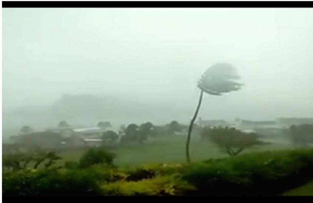
Cyclone Winston ravaging the Savusavu area in March. Saturday, April 23, 2016

“What we decide will define our future, no nation large or small is immune to what this means...submerged countries, abandoned cities, desperate people...” President Obama, Paris, December 2015